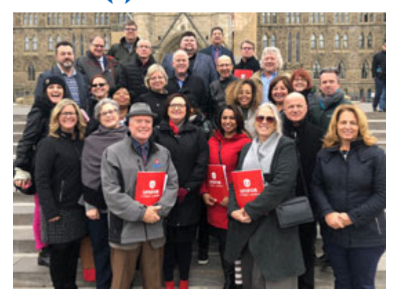
Activists lobby in Ottawa to urge the